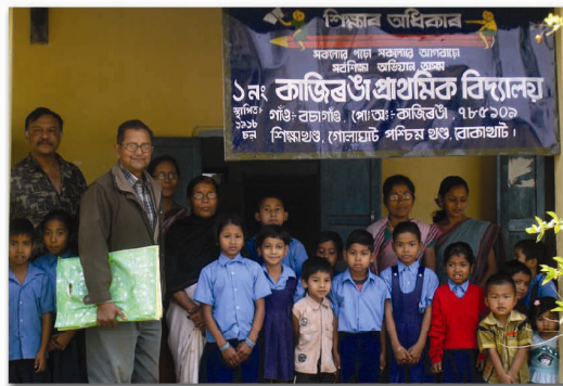
Discourse on Man-Animal conflict