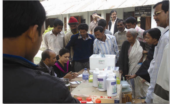
Veternary Medicines being distrubuted free to the farmers at Kohora